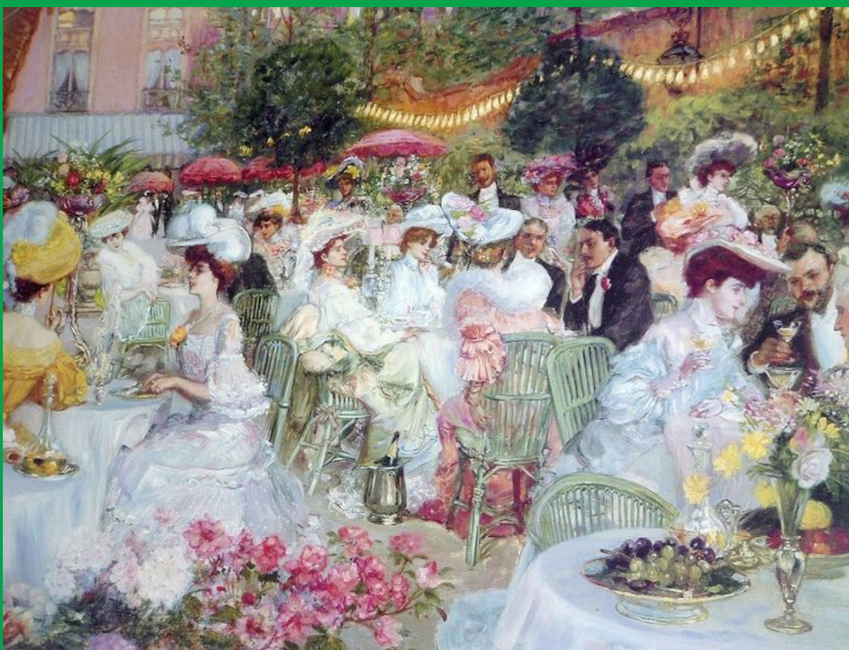
(The Ritz garden cafe by Pierre-Georges Jeannot)